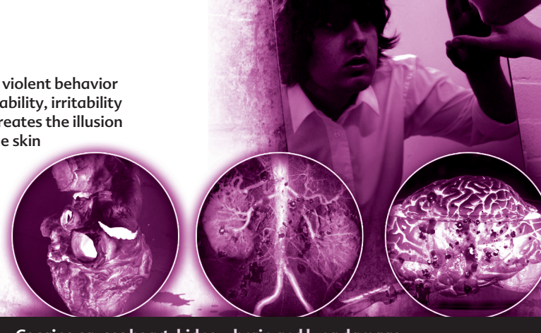
Cocaine causes heart, kidney, brain and lung damage.

Convulsions, seizures and sudden death from high doses (even one time).